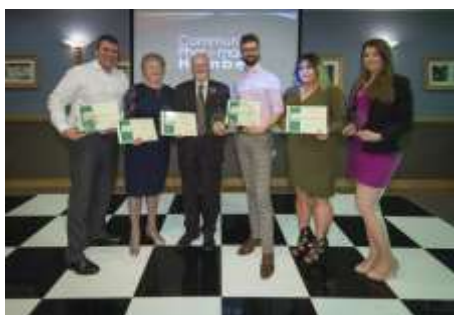
Winners of all award categories celebrating success.