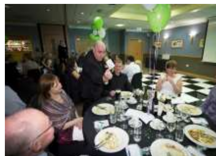
Being entertained during courses.